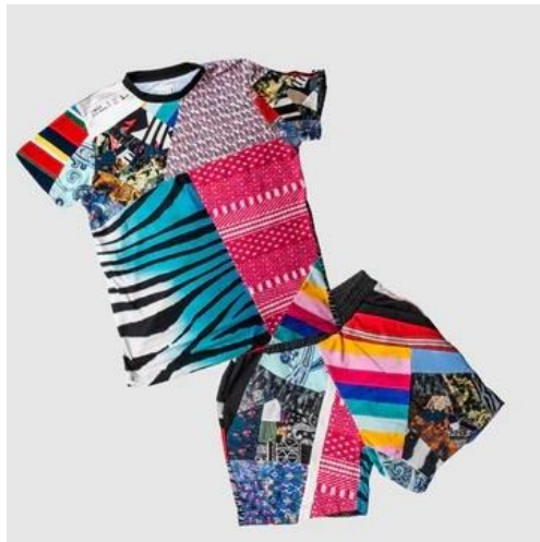
zero waste daniel clothing

Just like pre-used clothing, leftover “post-industrial” materials from garment manufacturing is a resource to be tapped. To disrupt fashion's take-make-waste business model, we need to find as many ways as possible to keep resources alive and part of a circular world.