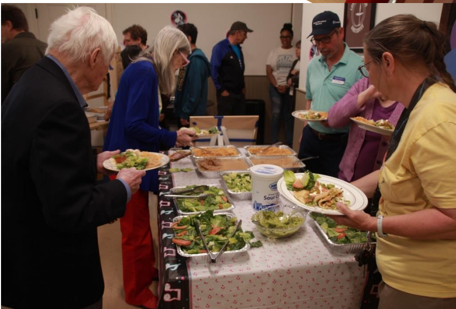
Camp Linden folks enjoy the tacos.