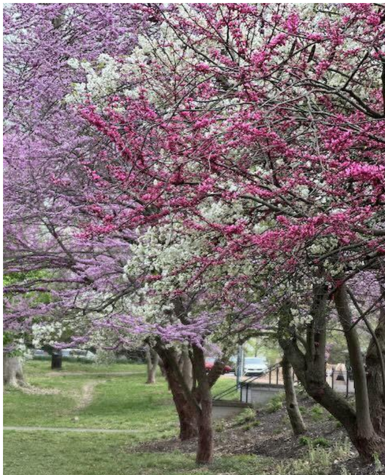
Marshall Square Park, West Chester.

As in so much else, buyer beware! The corporate culture that once said smoking was safe and told western PA residents that fracking produced no adverse effects on the environment now say bottled water is perfectly safe. Unfortunately, we all have a lot of work to do just to defend ourselves and our environment. Earth Day is a good time for that.