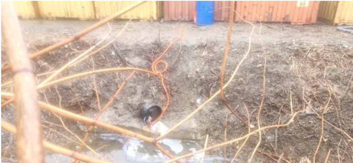
The site of a spill at Goose Creek in West Goshen.

Finneran noted that Goose Creek is a headwater stream and eventually drains into the City of Chester.